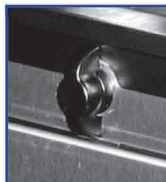
Deal Tray Lock